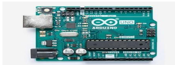
Fig 4: ARDUINO UNO

Microcontroller is a computer on a chip. Micro suggests that the device is small, and the controller tells you that the device' might be used to control objects, processes, or events. Another term to describe a microcontroller is embedded controller, because the microcontroller and its support circuits are often built into, or embedded in, the devices they control. It is a temporary storage unit. Arduino is an open-source microcontroller which can be easily programmed, erased and reprogrammed at any instant of time. Arduino uses a hardware known as Arduino development board and software for developing code known as IDE. The micro controller board used in our design is Arduino Uno, it is an open source platform used for building the electronic projects, it has both physical board and has own unique simplified programming language and has the endless possibilities such as can interface several sensors, actuators like motors, here we did not required any dumper kit to dump the program in to the board Coming to the specification of Arduino Uno microcontroller board, it uses Atmega328p-pu as the main microcontroller, the operating voltage of the board is 5v, the recommended input voltage and limit input voltage is 7v-12v and 6v-20v. It consists of 14 digital input/output pins, 6 PWM digital input/output pins and 6 analog input pins, the dc current obtained from input/output pins is 20ma, and from 3.3v pin is 50ma.