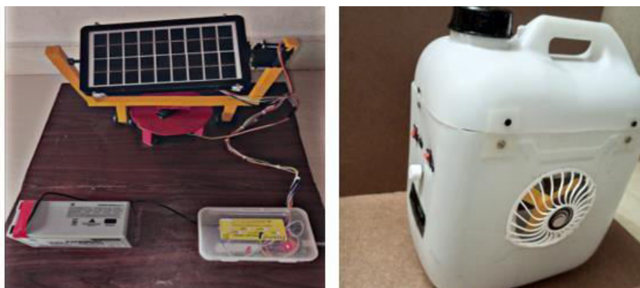
Fig 5: Hardware Implementation