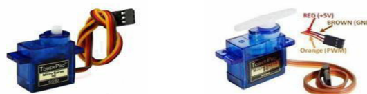
Fig 3: Servo Motor

A servo motor is an electrical device which can push or rotate an object with great precision. It rotates an object at some specific angles or distance. A servo motor shown in Figure is just made up of a simple motor which runs through servo mechanism. It can reach a very high torque in a small and lightweight package. Due to these features, they are being used in many applications like Robotics, machines, cars etc. A servo motor can usually only turn 90 in either direction for a total of 180 movement. Servo motors are rated in Kg/cm (kilogram per centimeter). This Kg/cm tells how much weight the servo motor can lift at a particular distance. The position of a servo motor is decided by electrical pulse and its circuitry is placed beside the motor.