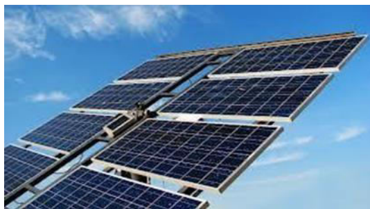
Fig 2: Solar Panel

A solar panel (photovoltaic module or photovoltaic panel) is a packaged interconnected assembly of solar cells, also known as photovoltaic cells. The solar panel is used as a component in a larger photovoltaic system to offer electricity for commercial and residential applications. Because a single solar panel can only produce a limited amount of power, many installations contain several panels. This is known as a photovoltaic array.